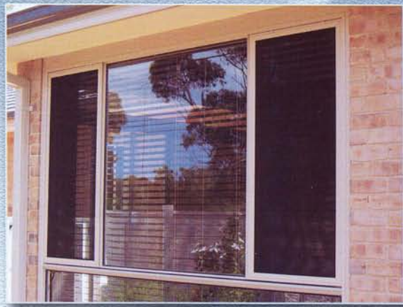
INVISI-GARD Security Screen