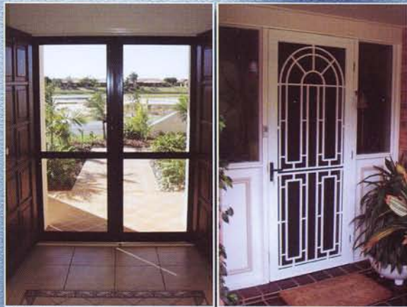
INVISI-GARD Hinged Door