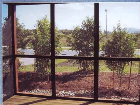
INVISI-GARD Patio Frame