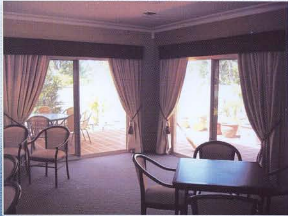
INVISI-GARD Sliding Door